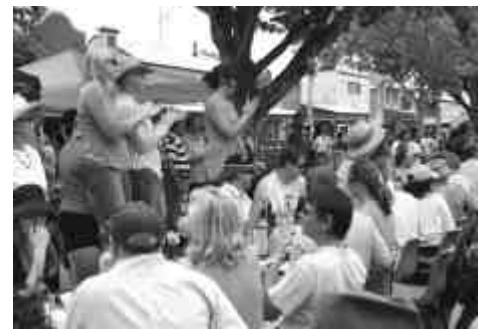
GREAT ENTERTAINMENT: Get ready for another great day of food and entertainment.

day out. As always there'll be plenty to see and do at StreetFeast with market stalls offering an abundance of art, craftworks, clothing, produce and local wares. See you there.